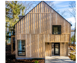
mixed shade result