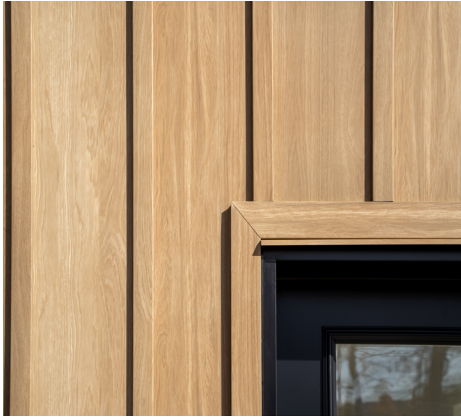
REVERSE BOARD AND BATTEN (RBB)