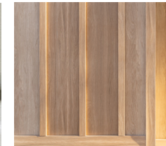
3 planks | 6 shades