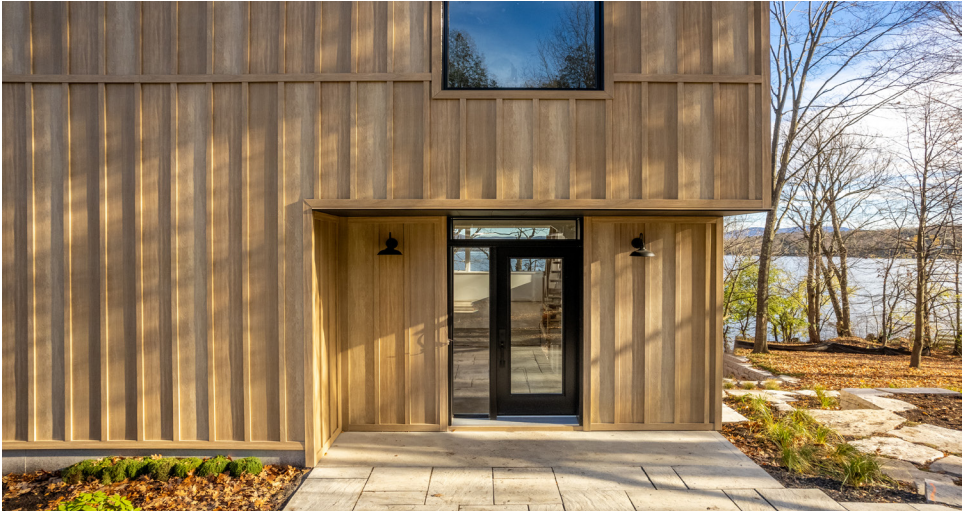
BOARD AND BATTEN (BB)